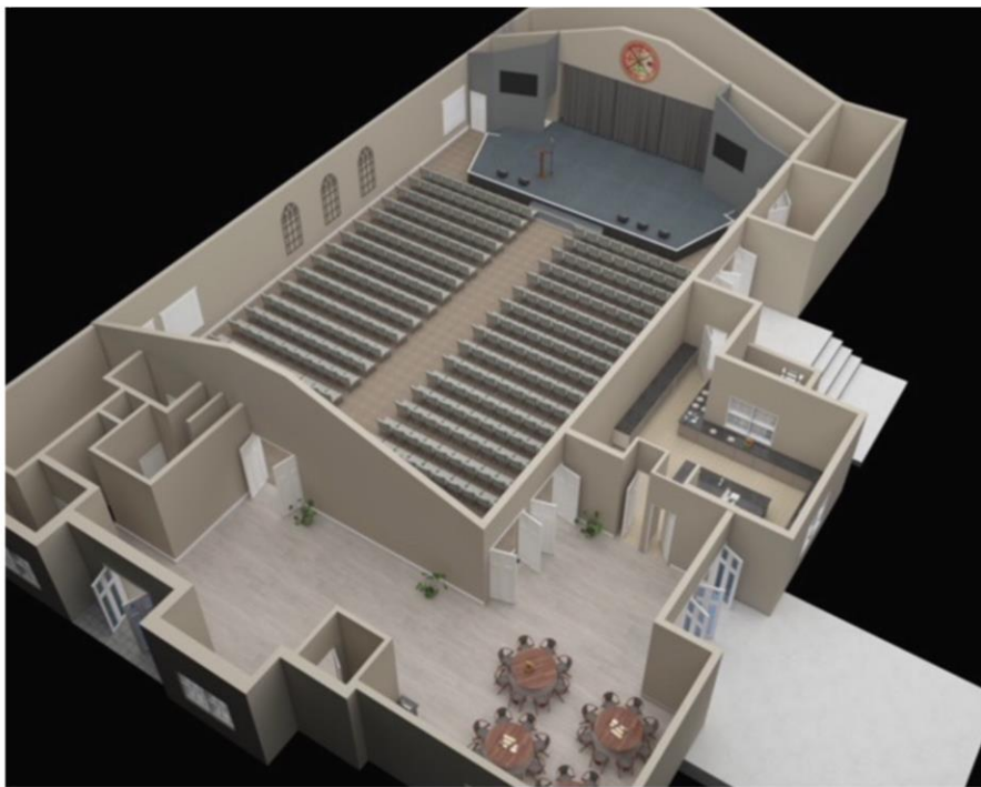
Rendering of a renovated Maxwell Hall.